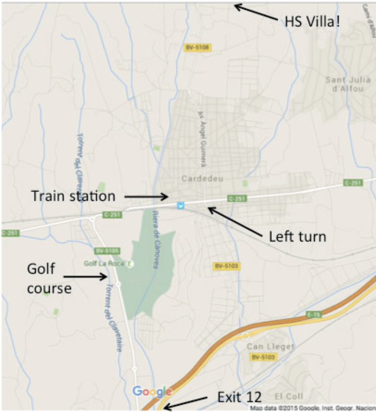
Map 1: Zoomed Out