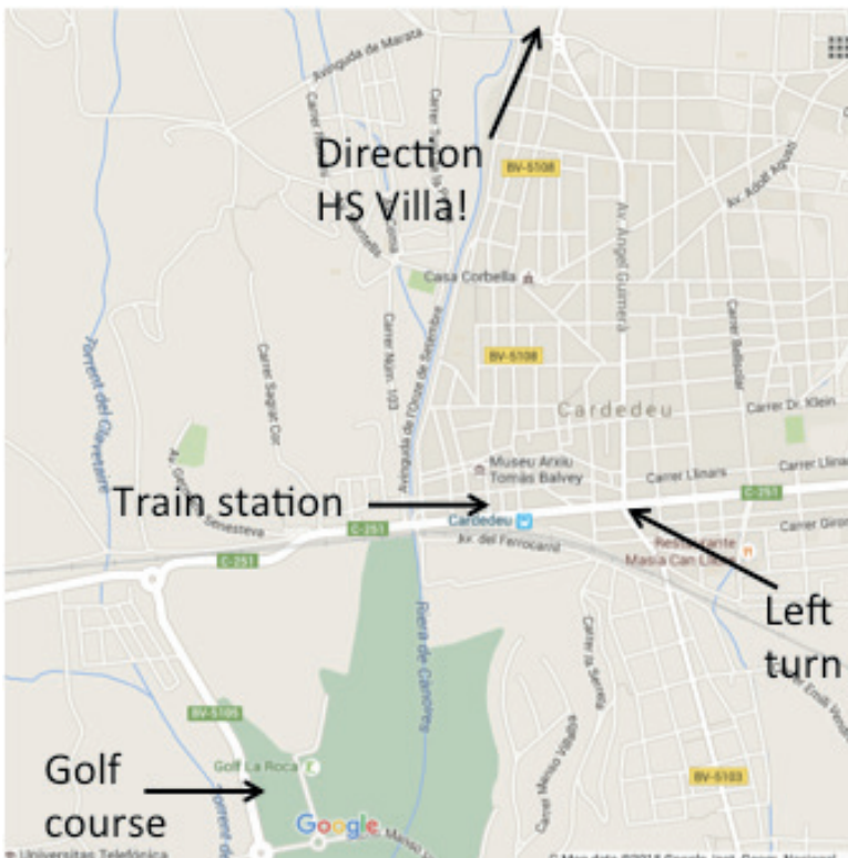
Map 2: Zoom in on Cardedeu Town